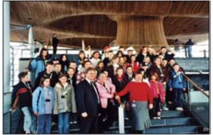
YSGOL CARROG - St. David's Day Concert