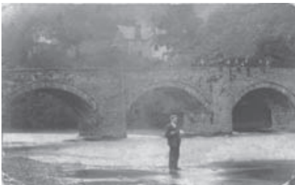
An undated picture of Pont Carrog before the days of heavy wagons

If anyone does see a large vehicle stuck on the bridge please record the details and if possible take a photograph!