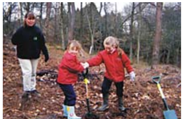
Ysgol Carrog pupils tree planting on Pen y Pigyn

The School is again collecting Tesco and Sainsbury vouchers if you have any to spare.