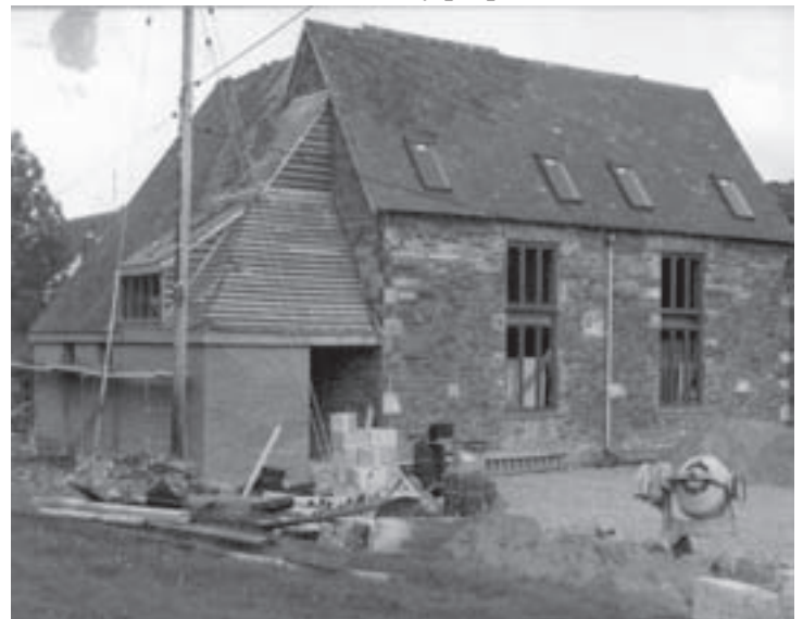
The Neuadd undergoing the original renovation in 1981 following its purchase from the Church in Wales.

Numerous complaints have been lodged with Denbighshire County Council but to no avail. Strange that having lost, through retirement, our influential and respected County councillor the concerns of Carrog now seem to be ignored. The article entitled 'A Hard Act to Follow' published on his retirement now seems remarkably prophetic.