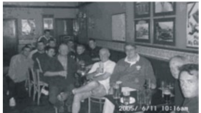
Both teams enjoying hard earned glasses of leminade in Fort William